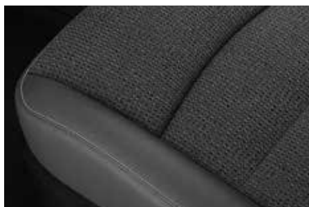
Heavy-Duty Vinyl – Diesel Grey SLT – Standard