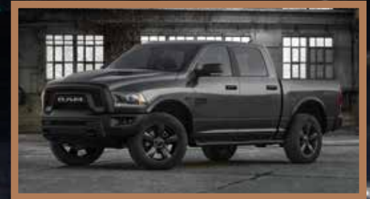
Warlock in Granite Crystal Metallic.

AGGRESSIVE CAPABILITY WITH A BOLD EXTERIOR LOOK.