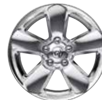
20-inch chrome-clad aluminum Standard on SXT Plus; Available on Express with Express Wheel & Sound Group (WHK)