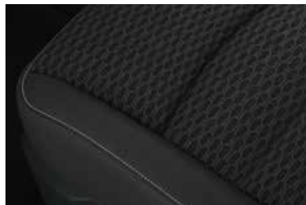
Cloth – Black Night Edition and Warlock – Standard