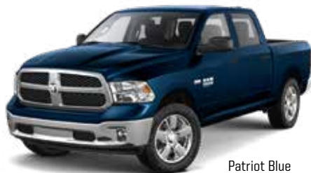
Patriot Blue Pearl