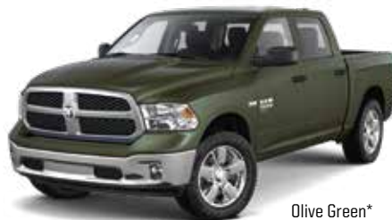
Olive Green* Not available on Express*