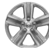
20-inch polished aluminum Available on SLT with SLT Plus Décor Group (WRF)

TO SEE MORE EXAMPLES OF POSSIBLE EXTERIOR COLOUR COMBINATIONS, VISIT RAMTRUCK.CA