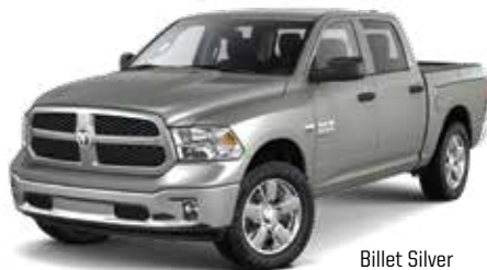
Billet Silver Metallic