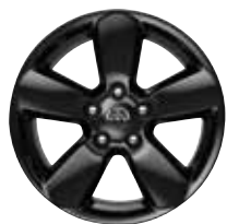
20-inch Semi-Gloss Black aluminum Standard on Express Blackout, Night Edition and SLT Black Appearance Package (WHN)