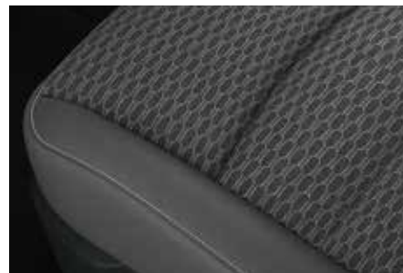
Cloth – Diesel Grey Express, SXT Plus and SLT – Standard; ST – Available