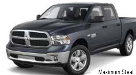
Maximum Steel Metallic