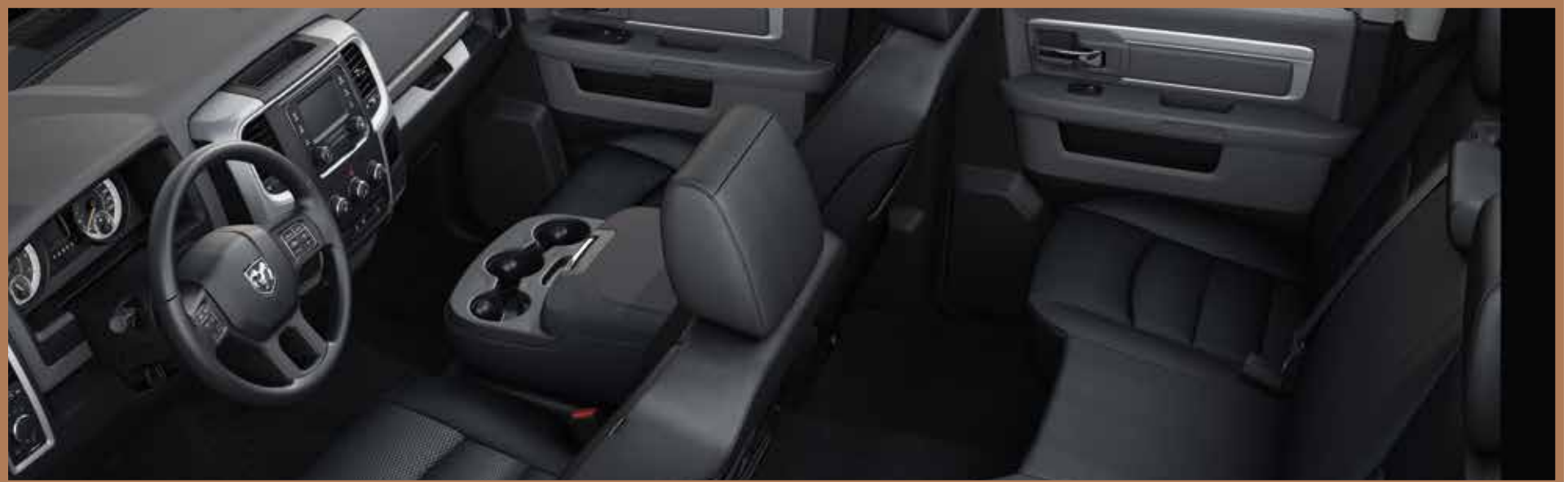
Warlock interior in Black cloth.