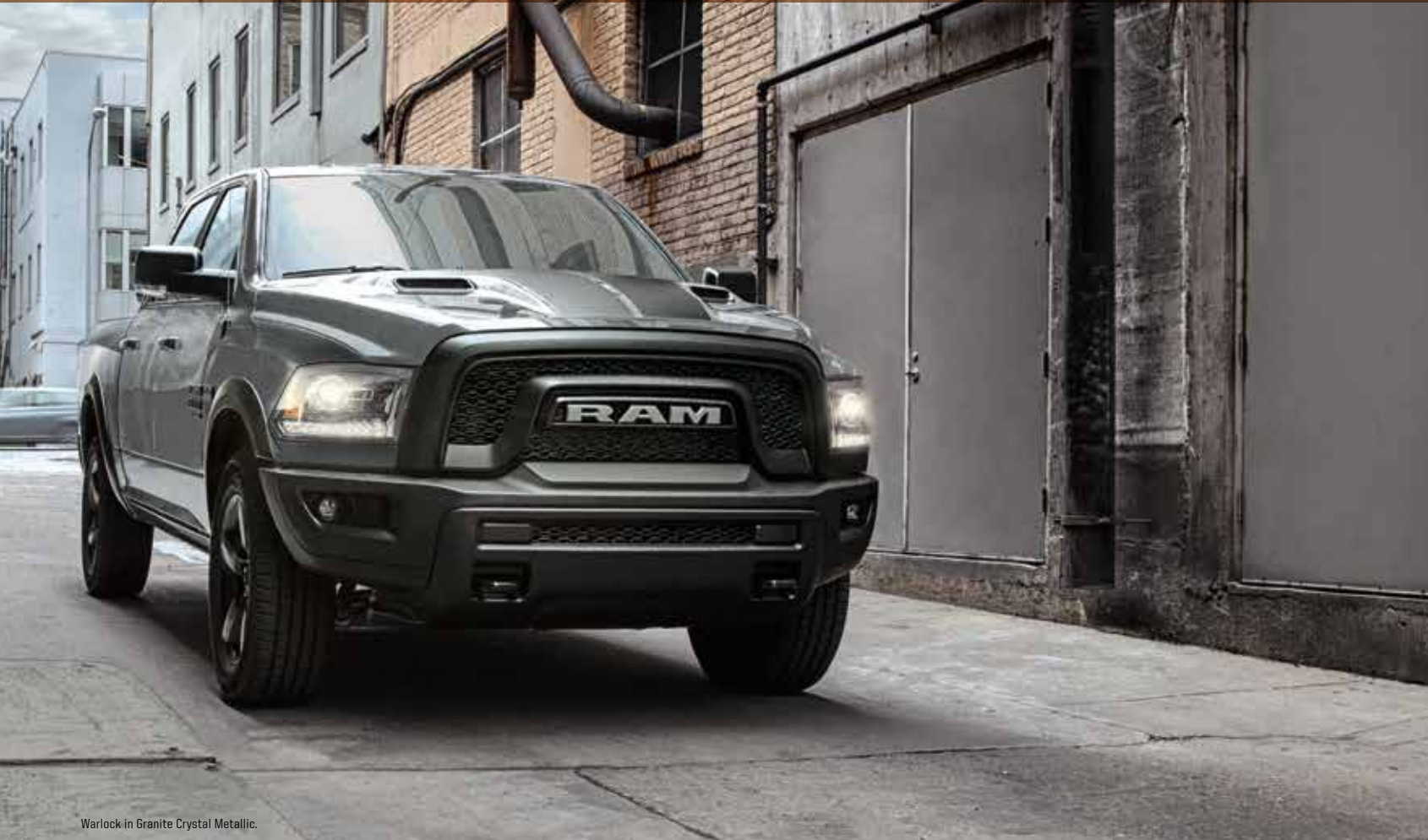
Warlock in Granite Crystal Metallic.