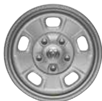
17-inch lightweight steel Standard on ST and Tradesman® (WFP)