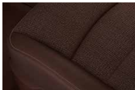
Premium Cloth – Canyon Brown SLT – Available