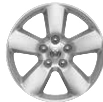
20-inch aluminum Available on SLT; Standard on SLT with SLT Plus Décor Group (WHE)