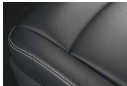
Premium Mopar® Katzkin™ Leather – Diesel Grey SLT – Available