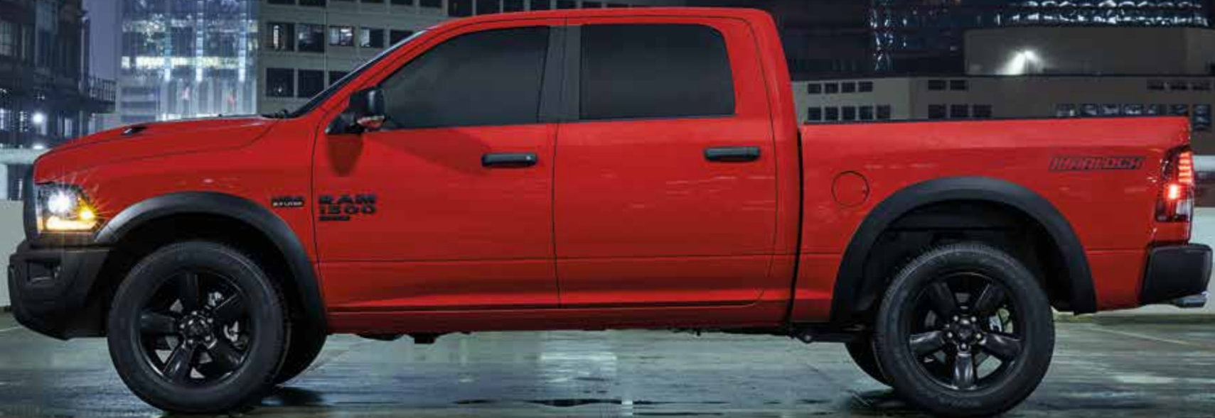
Warlock in Flame Red.

SLEEK DESIGN MEETS ROCK-HARD CAPABILITY. THAT'S RAM 1500 CLASSIC WARLOCK. As the top-of-the-line Ram 1500 Classic model in Canada, Warlock creates an unforgettable response the moment you see it. Street presence starts with a characteristic Black against body-colour and the aggressive Sport Performance Hood. Powered by the standard 3.6L Pentastar™ V6 or optional 5.7L HEMI® V8 engine, Warlock rides on authoritative 20x8-inch Semi-Gloss Black wheels. Inside, look for cloth seating and the 6-ring instrumentation cluster. In 4x4 only, as a Quad Cab® or Crew Cab.