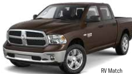
RV Match Walnut Brown Metallic Not available on Express