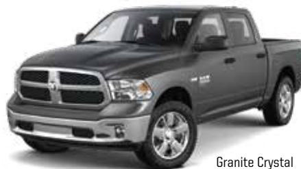
Granite Crystal Metallic