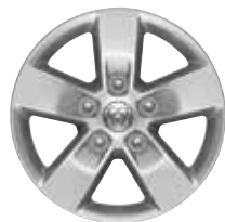
17-inch aluminum Standard on Express® and SLT (WFE)