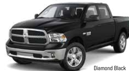
Diamond Black Crystal Pearl