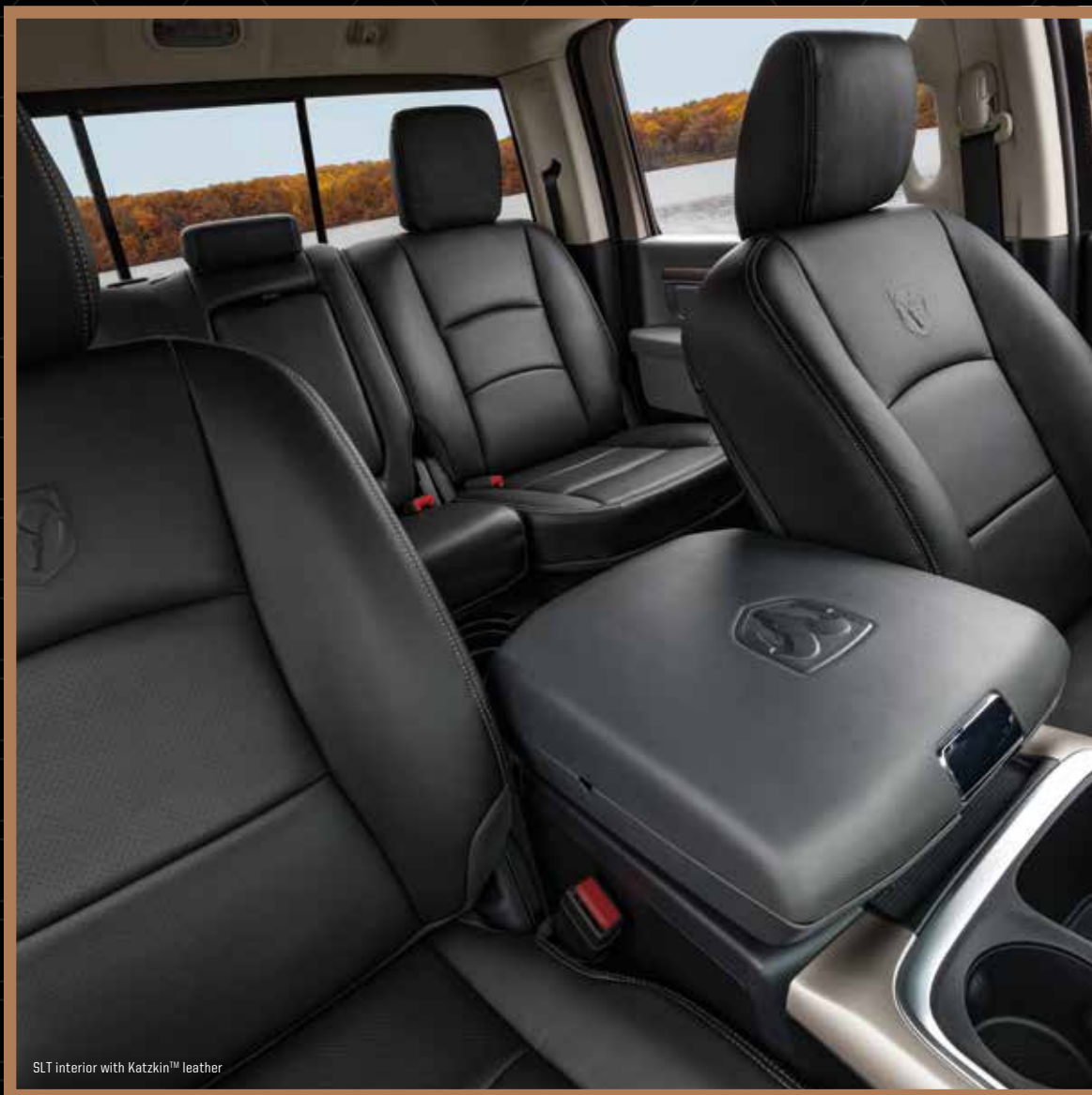
SLT interior with Katzkin™ leather